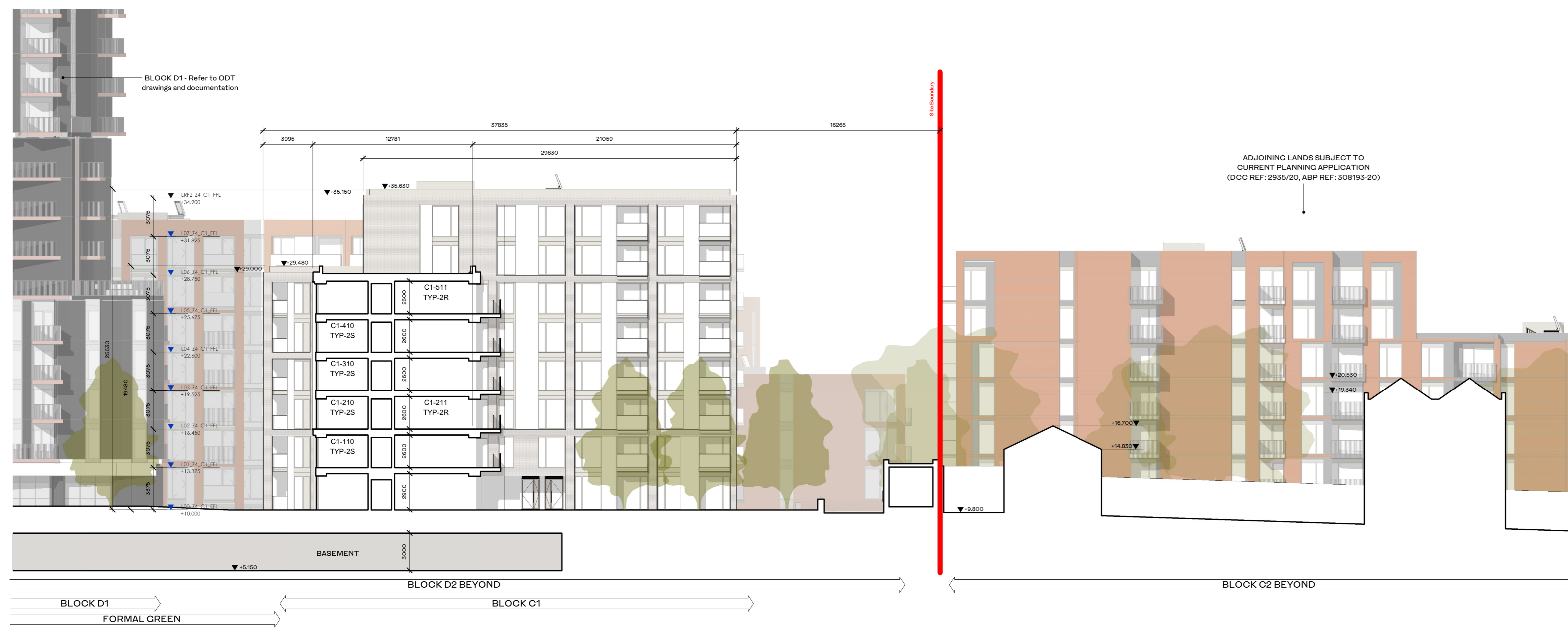
2 GA Section - Section D-D 1 : 200